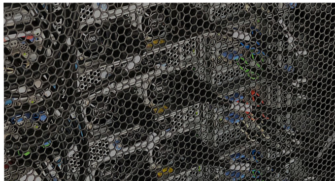
Magerit-3 Supercomputer managed by Supercomputing and Visualization Center of Madrid (CeSViMa).