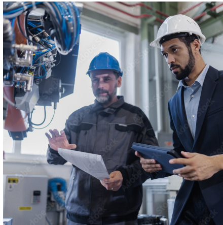
Industrial automation, industrial PCs (IPCs), human-machine interfaces (HMIs)