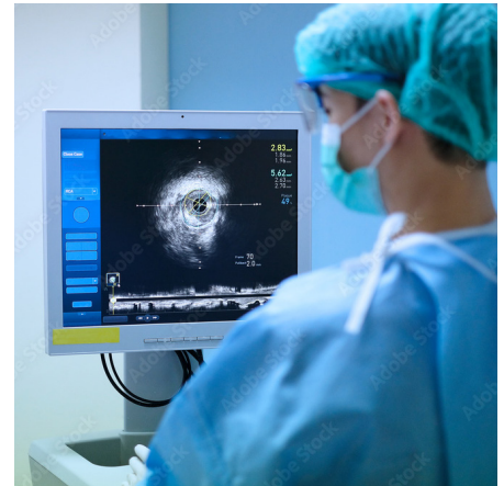
Ultrasound imaging, AI-enabled diagnostics, clinical devices