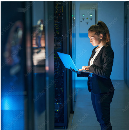
SD-WAN uCPE, next-gen firewall (NGFW), unified threat management (UTM) systems

The 13th Gen Intel Core processor platform brings higher processing power and AI capabilities to support rigorous cybersecurity and other data-intensive use cases at the edge.